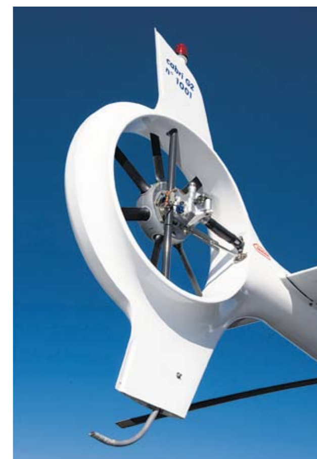
7-blade tail rotor enclosed within Eurocopter-like Fenestron.