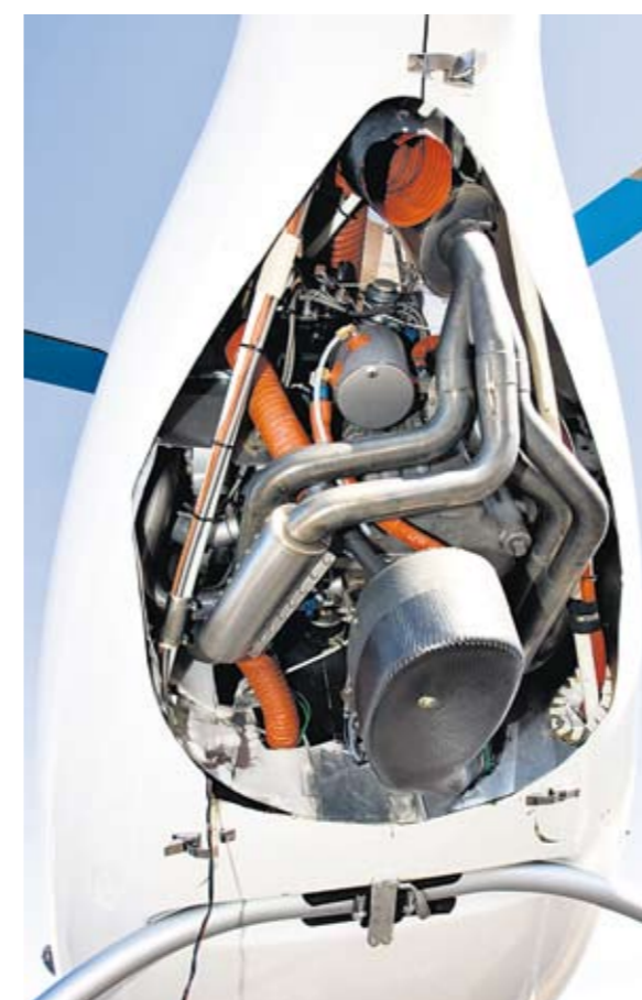
Lycoming O360 engine derated from 180 to 145bhp.

Hélicoptères Guimbal S.A. Aérodrome d'Aix-en-Provence 13290 Les Milles, France T: +33 (0)4 42 39 10 80 E: infos@guimbal.com W: www.guimbal.com