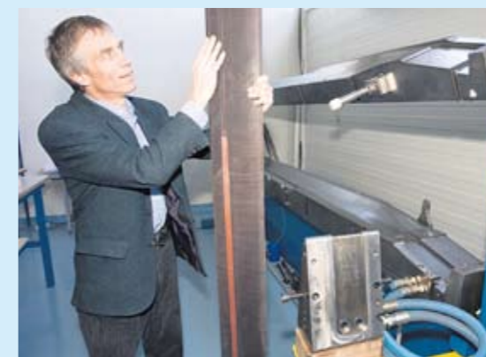
The company has its own blade manufacturing shop.