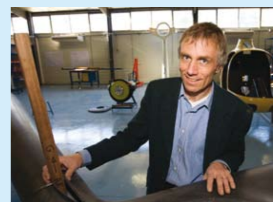
New factory is being prepared for series production.