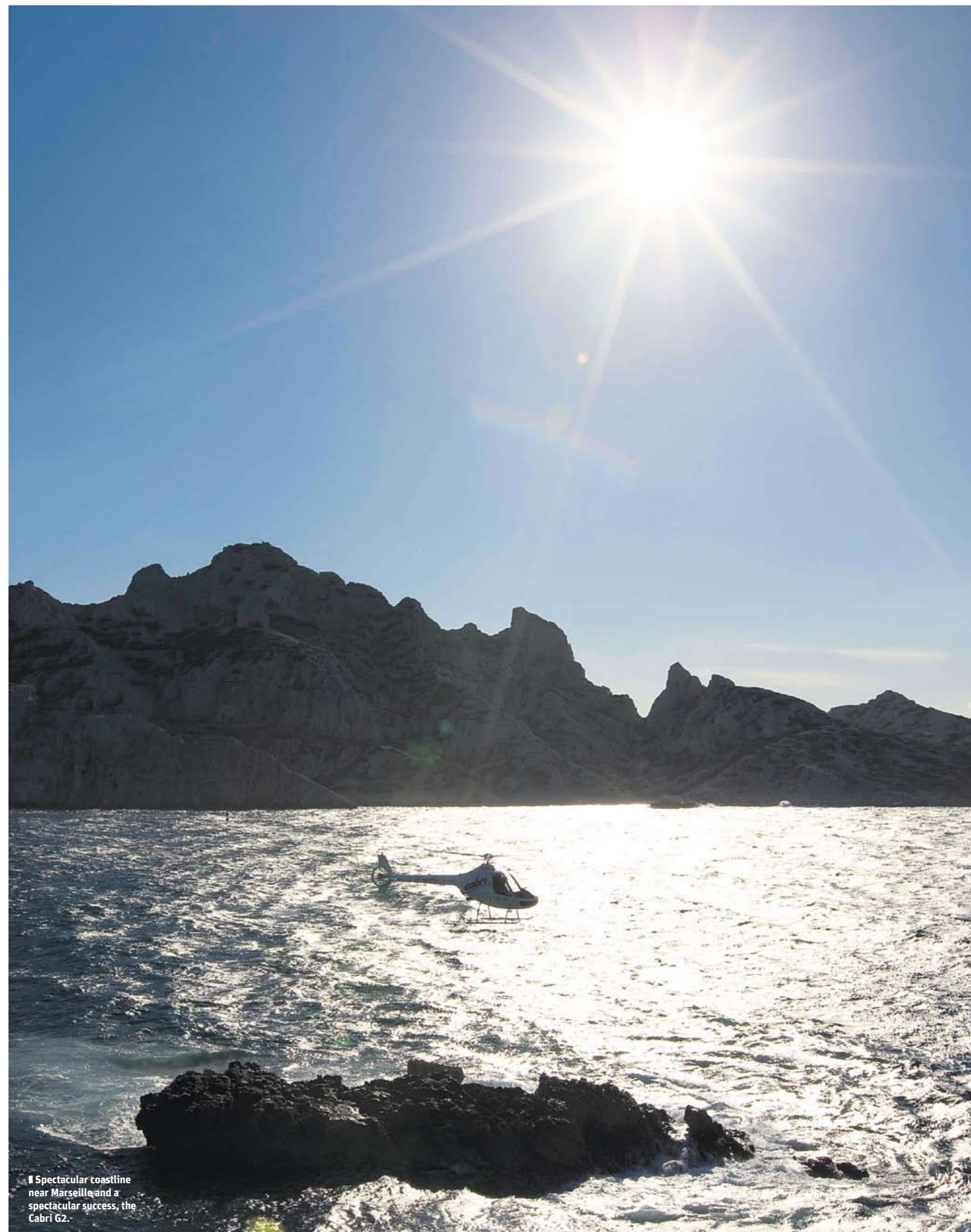
» Spectacular coastline near Marseille and a spectacular success, the Cabri G2.