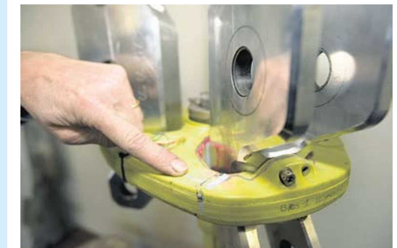
All the tooling for the Cabri has been made by the company.